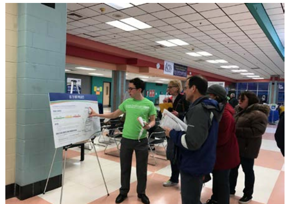
Figure 1: Project Team Member explains the US 29 Corridor to community members at an open house on March 13, 2017

The overarching goal of the US 29 Bus Rapid Transit (BRT) outreach effort is to educate the public on the project objectives and engage with stakeholders to collect meaningful feedback which can be incorporated into the project design. Within the outreach strategy, the project team will use a wide variety of public engagement tactics to reach diverse audiences within the US 29 service corridor. The outreach efforts build on the "Get on Board BRT" outreach program launched by Montgomery County in fall 2016, with the goal of establishing deeper knowledge of the US 29 BRT project by creating project-specific information and materials. Expanded community programming will integrate the public into the project's outreach process.