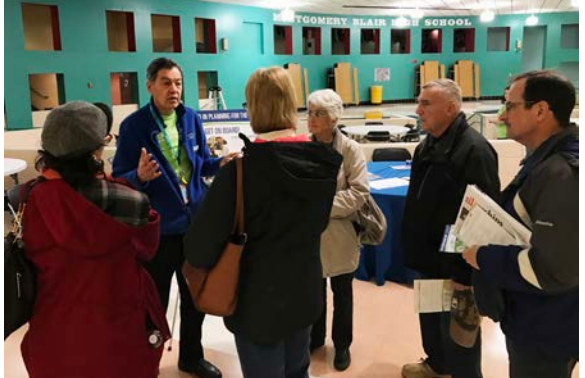
Figure 2: Get on Board BRT will reach out directly to the community on issues of concern.

Community meetings are an opportunity for additional, focused discussion. A community meeting involves a presentation and facilitated discussion about major concerns or questions that have arisen during the outreach process. The project team will recruit experts in the issue area to present and facilitate. In-depth discussions will inform the project team and assist in the design of the project. The meeting may involve other interactive components, and type of interaction may depend on the size of the meeting. Issue area topics may include operation planning, service planning, multi-modal access including bicycles and pedestrians, station infrastructure, and any other issues of interest or concern to residents and impacted businesses. Example of meeting partners are listed in Table 2 .