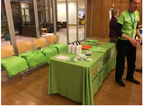
Figure 5: "Get on Board BRT" giveaways available to the public as engagement incentives

Employee focus groups will take place in partnership with multiple employers served by the future US 29 BRT project. Key partners could include: FDA, Silver Spring Downtown Business District, Adventist Hospital and other major corridor employers. The project team will create the focus group content and a digital voting activity to capture feedback in real time. This effort will provide additional inputs into the US 29 service planning effort and station design.