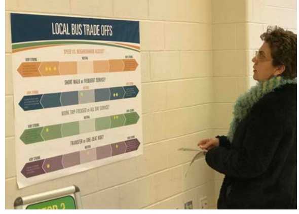
Figure 4: Community member completes the trade-off activity at the Open House on March 15, 2017.

The next set of Open Houses will take place in November 2017 and will be designed to update the public with findings from the preliminary design phase of the project. The project team will use local examples to create and display visualizations of the project corridor, including