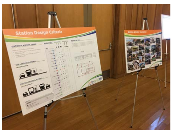
Figure 3: Boards display information about BRT Station Design at the Open House on March 7, 2017.

Through the first round of Open Houses, the project team engaged 190 participants and received nearly 100 comment cards. This was a significant level of participation, and although there were inclement weather conditions during two of the events, the turnout remained steady through each open house. Comments received from participants through interactive activities are currently being tabulated and considered in the project design.