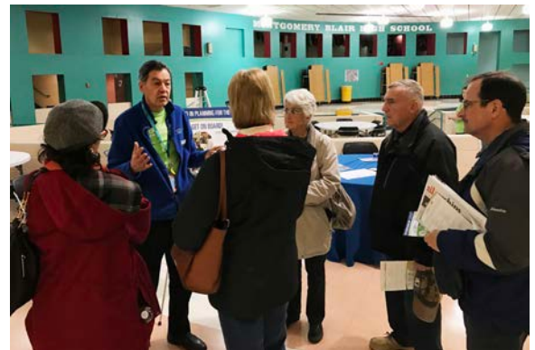
Figure 2: Get on Board BRT will reach out directly to the community on issues of concern.

Community meetings are an opportunity for additional, focused discussion. A community meeting involves a presentation and facilitated discussion about major concerns or questions that have arisen during the outreach process. The project team will recruit experts in the issue area to present and facilitate. In-depth discussions will inform the project team and assist in the design of the project. The meeting may involve other interactive components, and type of interaction may depend on the size of the meeting. Issue area topics may include operation planning, service planning, multi-modal access including bicycles and pedestrians, station infrastructure, and any other issues of interest or concern to residents and impacted businesses. Example of meeting partners are listed in Table 2 .