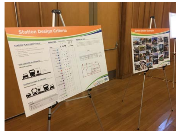
Figure 3: Boards display information about BRT Station Design at the Open House on March 7, 2017.

Through the first round of Open Houses, the project team engaged 190 participants and received nearly 100 comment cards. This was a significant level of participation, and although there were inclement weather conditions during two of the events, the turnout remained steady through each open house. Comments received from participants through interactive activities are currently being tabulated and considered in the project design.