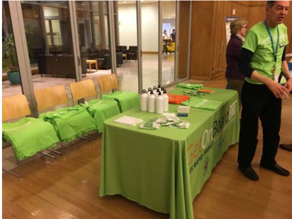
Figure 5: "Get on Board BRT" giveaways available to the public as engagement incentives

Employee focus groups will take place in partnership with multiple employers served by the future US 29 BRT project. Key partners could include: FDA, Silver Spring Downtown Business District, Adventist Hospital and other major corridor employers. The project team will create the focus group content and a digital voting activity to capture feedback in real time. This effort will provide additional inputs into the US 29 service planning effort and station design.