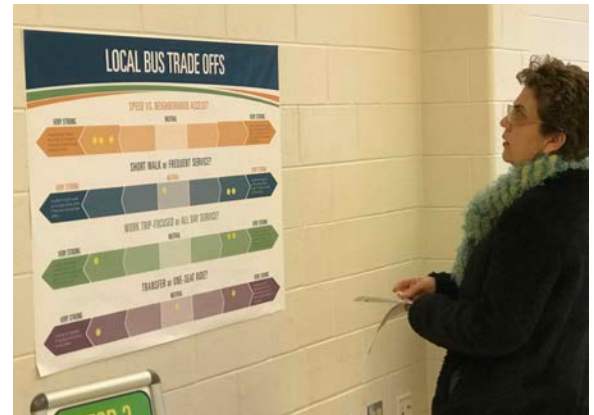
Figure 4: Community member completes the trade-off activity at the Open House on March 15, 2017.