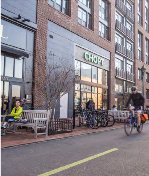
Ground-floor retail incorporates transparency and outdoor seating areas oriented onto the Capital Crescent Trail.

The upper floors of buildings should step back from the trail to allow access to sunlight and sky views as well as to provide compatibility with detached homes in close proximity. Building orientation along the trail should include elements such as entrances to common areas or retail, ground-floor transparency, individual unit entrances, outdoor terraces, plantings and seating areas. If the building does not provide orientation to the trail, it should include a larger setback with a planted landscape buffer.