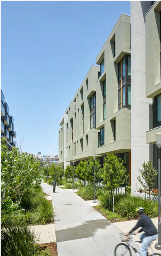
A large, multi-unit development incorporating lush landscaping, individual entries and a clear path for pedestrians and cyclists to pass through.