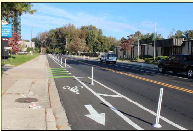
Example of a one-way separated bike lane

Title VI: Montgomery County assures that no person shall, on the grounds of race, color, or national origin, as provided by Title VI of the Civil Rights Act of 1964 and the Civil Rights Act of 1987, be excluded from the participation in, be denied the benefits of, or be otherwise subjected to discrimination under any program or activity.