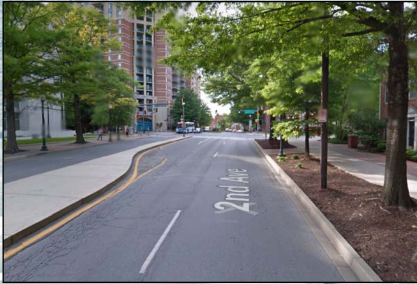
Top: Looking north on Second Avenue at Cameron Street. Right: Looking east on Wayne Avenue at Dixon Avenue.

Public input is the key to an effective planning process as it allows MCDOT and Montgomery County decision makers to understand the needs of the community.