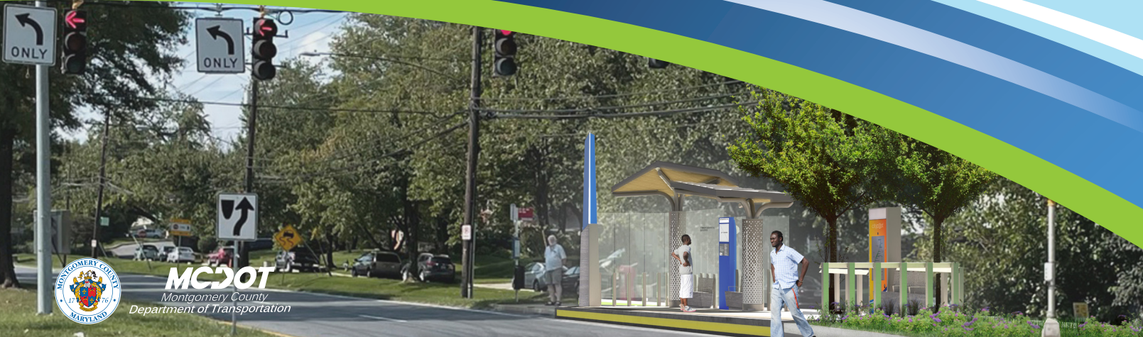
Proposed Bus Station: Westbound Veirs Mill Road at Twinbrook Parkway

Residents support adding Flash to our transportation network