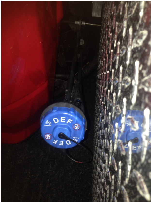
DEF FLUID ONLY