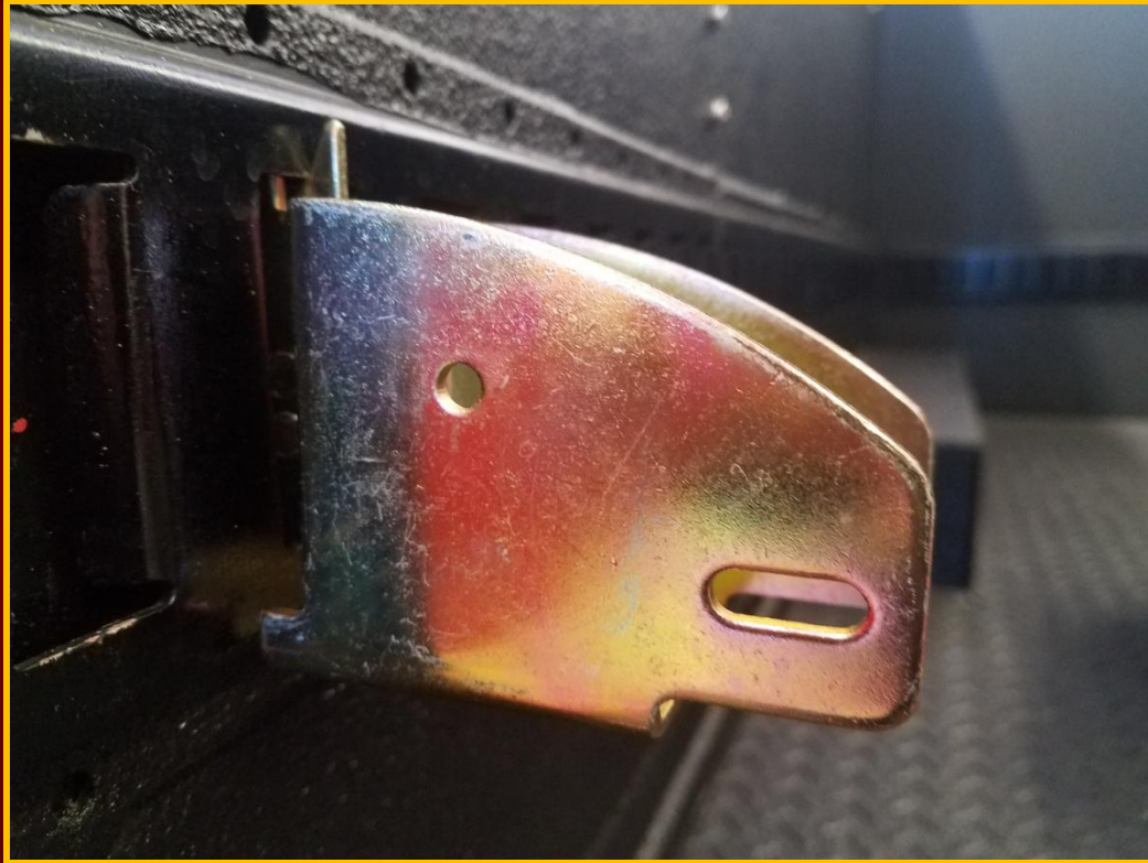
Installation of E-Trac Brackets