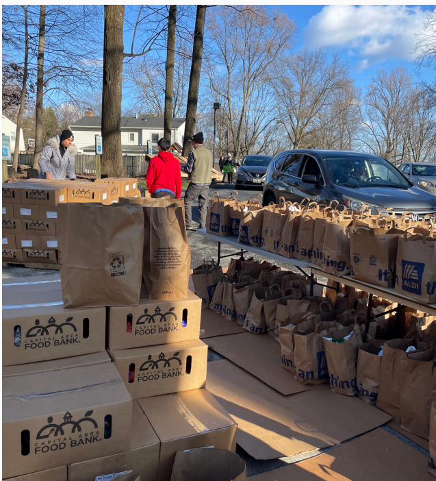
Photo Source: Community Distribution Event at Silver Spring Christian Reformed Church, February 2024

Projected additional benefit dollars invested in local economy monthly