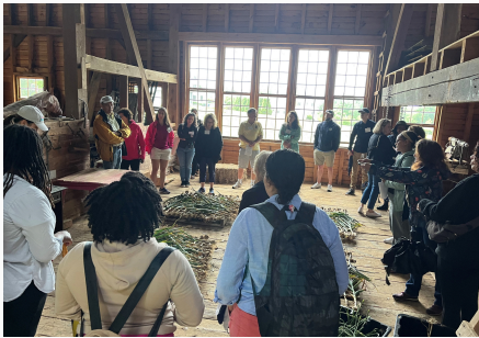
Photo Sources (Clockwise starting top left): OFSR-led panel at the National Anti-Hunger Policy Conference, April 2024; National Public Health Week Proclamation, April 2024; Sandy Spring Gardens Farm Tour hosted by Manna Food Center, May 2023