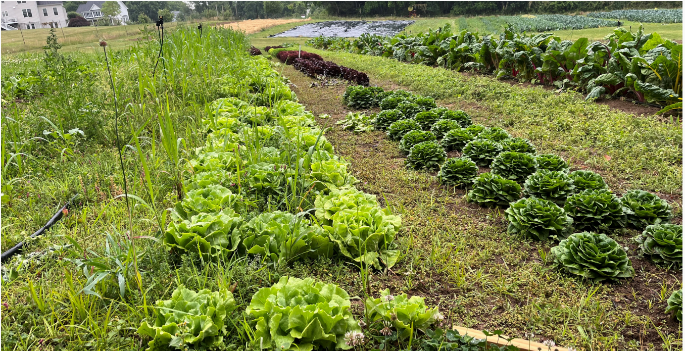
Photo Source: Sandy Spring Gardens Farm Tour with the Montgomery County Food Council, May 2023