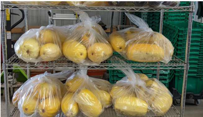
Photo Sources: Produce stored at the MoCo MicroHub, a collaborative cold storage investment acquired by the Montgomery County Food Council, with partnership from the Office of Agriculture and OFSR. Photos courtesy of the Montgomery County Food Council.