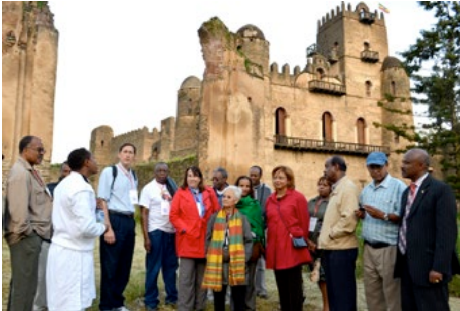
Members of the Montgomery delegation during a September 2012 visit to Fasil Ghebbi, site of the castles of Ethiopia's Emperors

With health care falling far short of demand, the main focus of the Gondar committee has been to collect and ship essential medical equipment to the Gondar Health Center. Montgomery College has developed a partnership with the University of Gondar. The