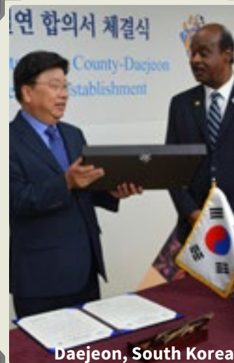
Daejeon, South Korea