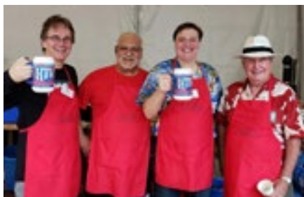
Rockville Hometown Holidays

The Rockville Sister City Corporation (RSCC), a 501(c)(3) nonprofit service organization was founded in 1986 to facilitate and maintain Rockville's Sister City relationships. Rockville celebrated its 60th Anniversary with Pinneberg, Germany in 2017 and looks forward to its 10th Anniversary with its Friendly Relations City, Jiaxing, China, in 2019.