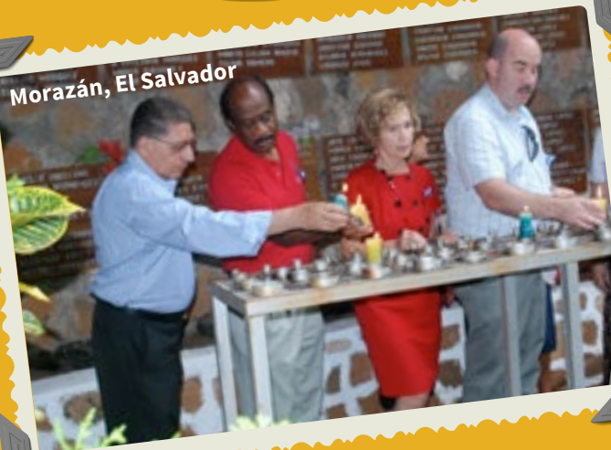
Morazán, El Salvador