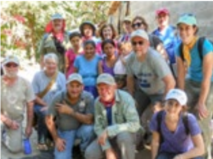
Habitat for Humanity volunteers