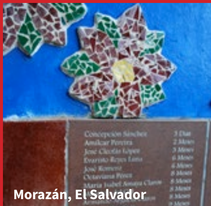
Morazán, El Salvador