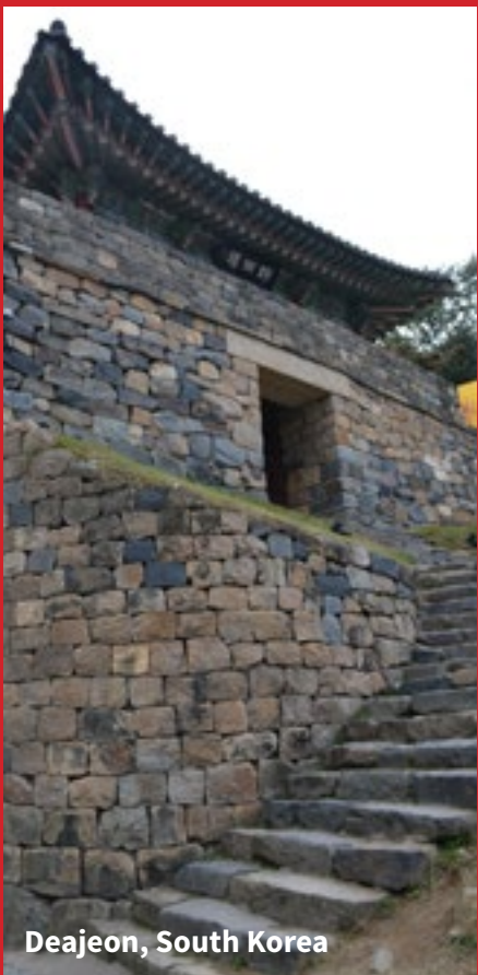
Deajeon, South Korea