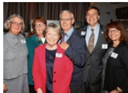
Thanksgiving in Pinneberg

In July, the Rockville Sister City Corporation welcomed a 19 member delegation from the People's Republic of China at Rockville's historic Glenview Mansion Cottage, in order to discuss Rockville's 61 year Sister City relationship with Pinneberg, Germany and its