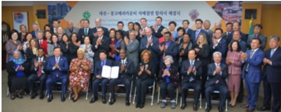
Montgomery County Executive Leggett and Daejeon Mayor Kwon Sun-Taik with Montgomery County delegation at October 23, 2017 signing ceremony

Humans first settled in the area formerly known as Hanbat during the Stone Age. For centuries, Daejeon was a sparsely populated village. This began to change in the early decades of the twentieth century when Daejeon became a key link of the nation's rail system. Much of the city was destroyed in a key 1950 battle during the Korean War. In the late 1980s, Daejeon's growth began to take off when it