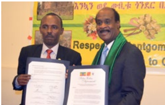
Deputy Mayor Getinet Amare and County Executive Ike Leggett after signing Sister City agreement in City of Gondar, Ethiopia on September 27, 2012

For more information about how you can get involved, please contact sistercities@montgomerycountymd.gov .