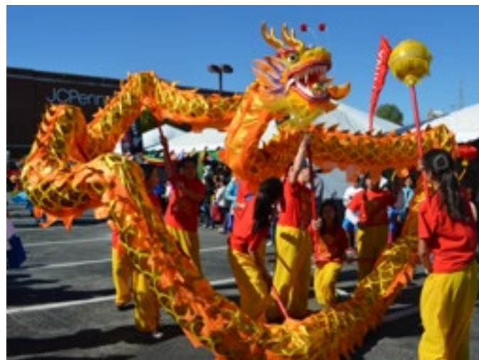
Performers at the Annual World of Montgomery Festival

To become a sponsor, performer, vendor, or participant at the Eleventh Annual World of Montgomery Festival in October of 2019, please contact sistercities@montgomerycountymd.gov .