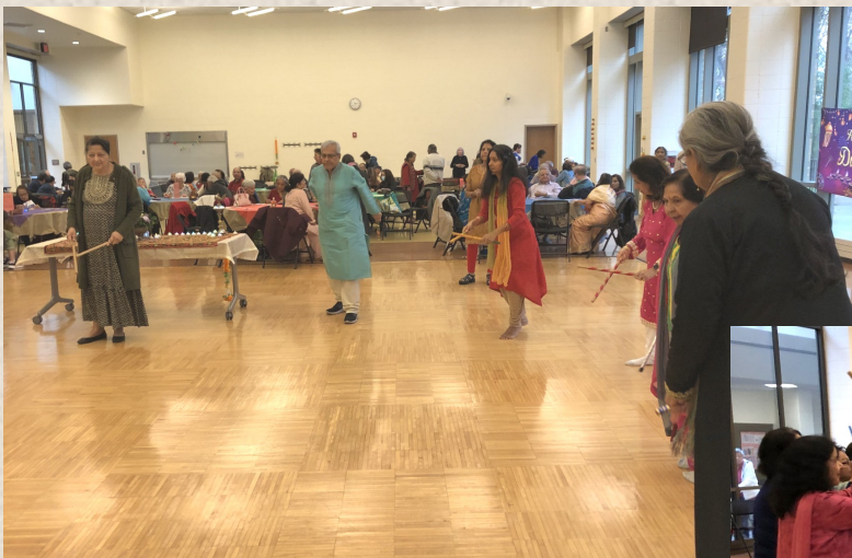
Diwali event at NPSC. Participating in Dandiya Raas (Indian Stick Dance) a social folk dance originating in the state of Gujarat in India.